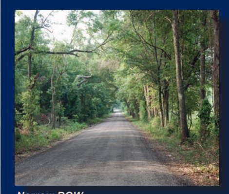
Narrow ROW – Trees very near roadway edge

Sharp 90-degree Bends: Often approached by straight sections of