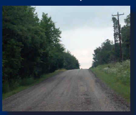
Sight distance over hill may be incompatible with speed accommodated by surface.

Can vield steep. hazardous side slopes or ditches; can force drainage features too close to travelway; can limit roadside "clear zone", often resulting in trees or power poles too close to travelway; can limit safe sight distances at intersections.