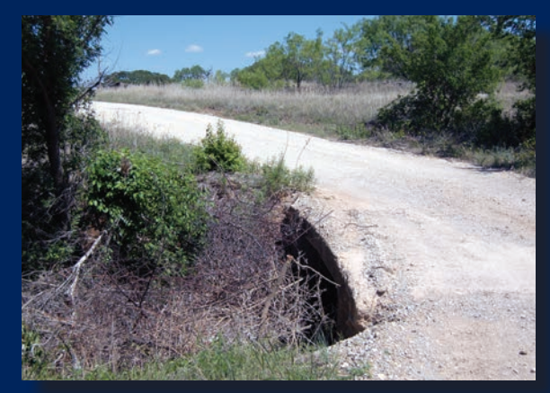
Drainage structure on curve at edge of unpaved road